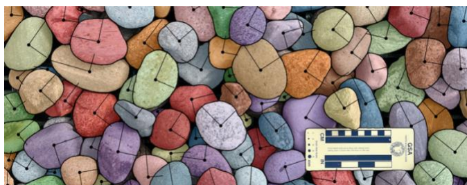
Example of an output from segmenteverygrain https://github.com/zsylvester/segmenteverygrain