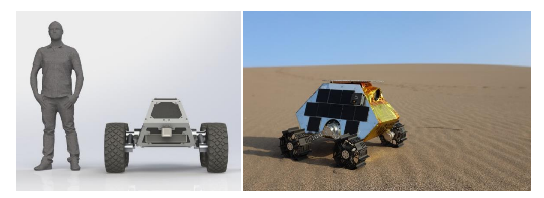
Figure 1: HL-MAPP for Earth based Applications and MAPP being tested at the Great Sand Dunes.

The goal of this project is to build upon NASA's open source, next-generation mission operations data visualization framework, Open MCT, and integrate the software with Lunar Outpost's MAPP rover architecture. Students will be challenged to test the limits of Open MCT by implementing mission operation control on a novel robotic platform starting from the open-source repository provided by NASA Ames Research Center. Development will be performed using several different robotic dev platforms and Lunar Outpost's cutting-edge simulation technology. This is a multidisciplinary project, and will require interaction with cloud platforms, robotics systems, web development frameworks, and networking challenges.