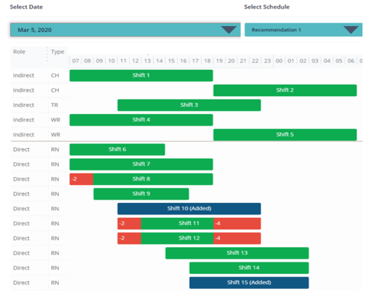
Figure 4. User Interface – optimal nurse schedule, shown for March 5, 2020.

We will create functionality within the webbased application to assign users to shifts, track edits to the shifts, and track hours to flag nurses for potential burnout. Figure 4 is the current front-end, implemented using programming language Angular JS, that enables the ED nursing manager to view and adjust future daily scheduling recommendations under various demand scenarios.