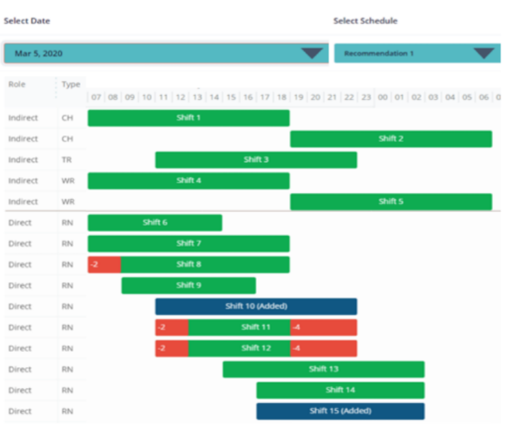
Figure 4. User Interface - optimal nurse schedule, shown for March 5, 2020.

We will revise our preliminary optimization model to express supply-demand matching for ED nurses across all patient cohorts based on the staffing and service thresholds defined by ED operations leadership. The forecast from (1) becomes an input to the optimization model. The model incorporates shift types allowed by the hospital's position control (e.g. 8, 10, and 12-hour shifts) and allowed shift flexing actions (Figure 3). Values for Nh and Fh are generated from the forecasting model. The model minimizes understaffing and overstaffing at each hour, where under- and over-staffing is estimated based on a target ratio. Moreover, the model enables tradeoffs between the relative importance of underage (e.g. understaffing/safety risk) and overage (overstaffing/cost risk) at any hour. The model is calibrated to meet a safe staffing level desired by the management