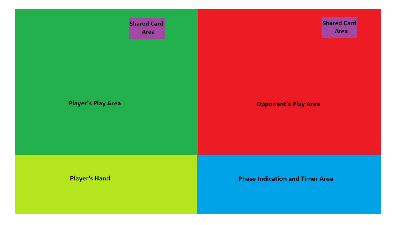
Figure 3: GUI Design

This lead to problems with having the board state on both players screens be incorrect and a flickering pattern on the shared area that was later resolved. Eventually this allowed us to have an information area with a phase indication and the timer located in a visually appealing place.