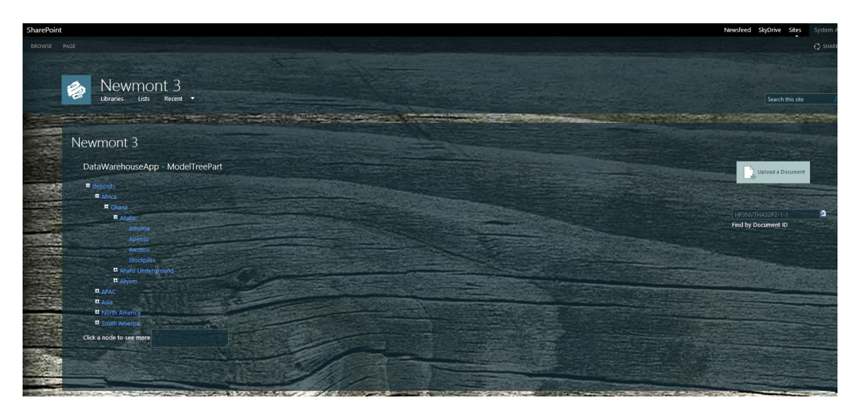
Figure 5: The SharePoint List