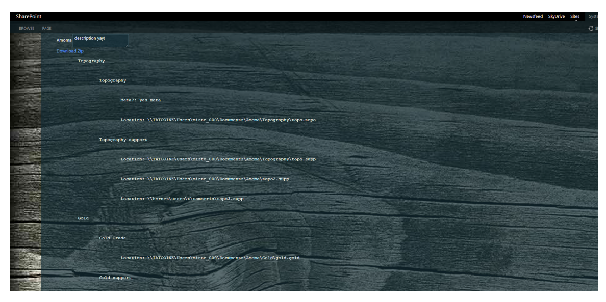
Figure 6: The Project Description On SharePoint

The tree in figure 5 uses the same xml metadata file from the model selector and populates a tree that represents all of the models that could have information stored on the SharePoint. Clicking any node loads additional data on that node.