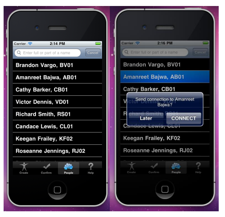
Figure 7: Find-as-you-type screen