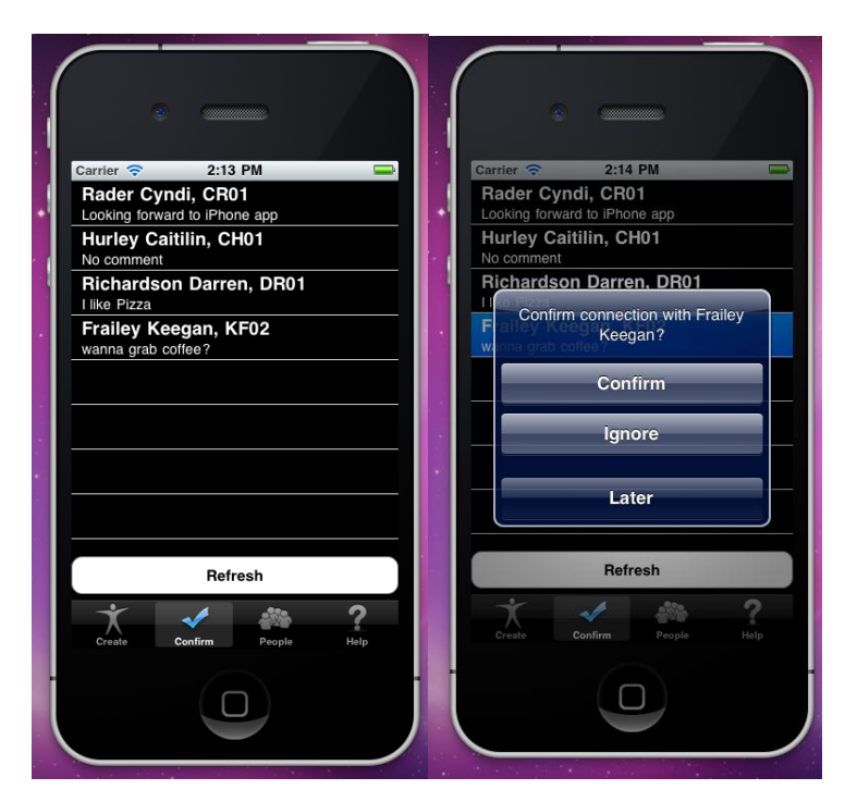
Figure 6: Confirm and view connection screens