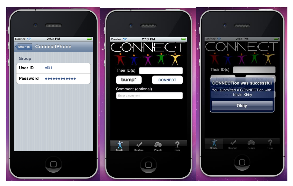
Figure 5: Log in, create and make connection screens