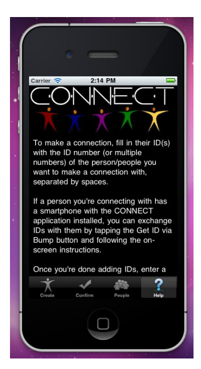
Figure 8: Help Screen